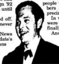
Charles Foster Kane Publisher The Whistleblower

And for those of you who think your vote doesn't matter, nine weeks from today you'll have your chance to prove it.